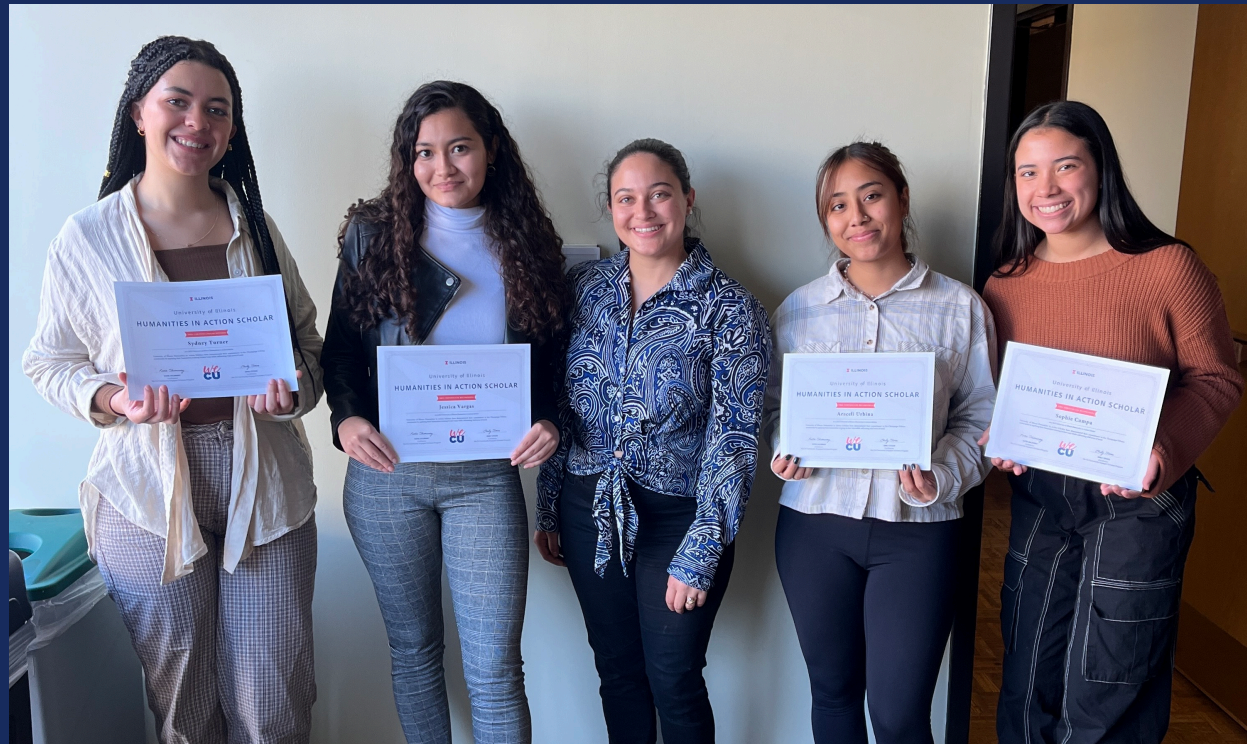
Humanities in Action Celebratory Lunch 2023