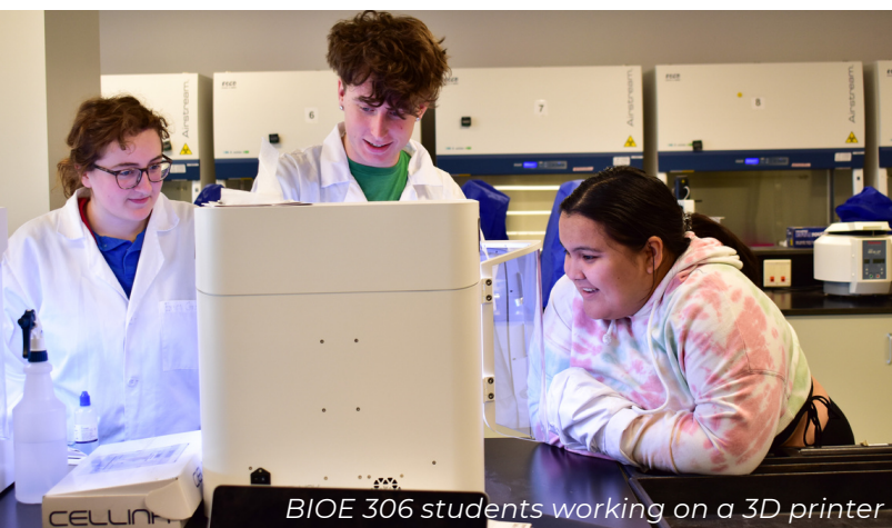
BIOE 306 students working on a 3D printer