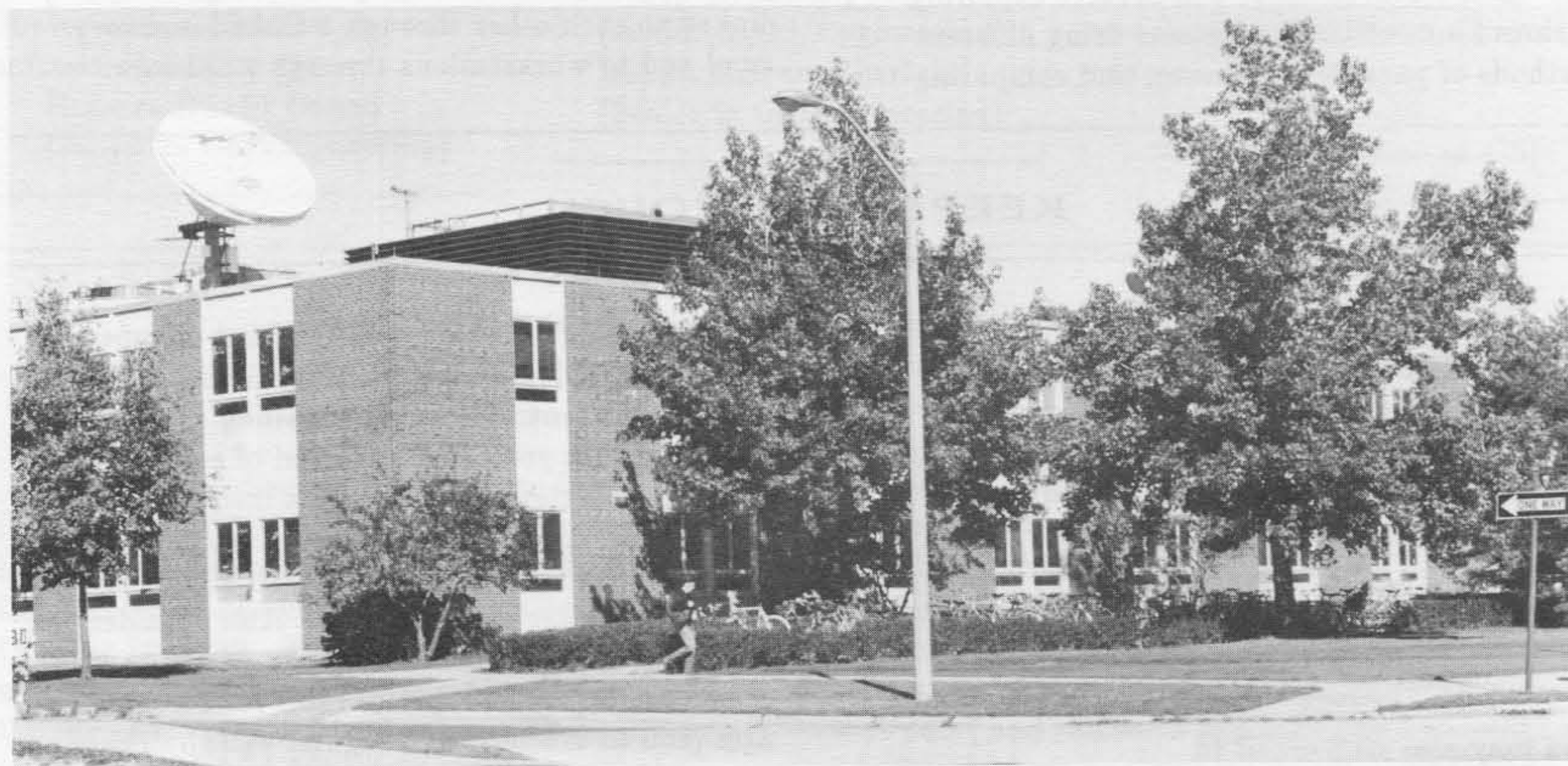
Early 1988. The trees and lawn will soon give way to bricks and steel.

As the photos on this and the following page show, construction is progressing rapidly on the addition to the Digital Computer Lab. All of these pictures are of the southwest corner of DCL, looking toward the northeast. In some of them, you can see Uni High School in the background.