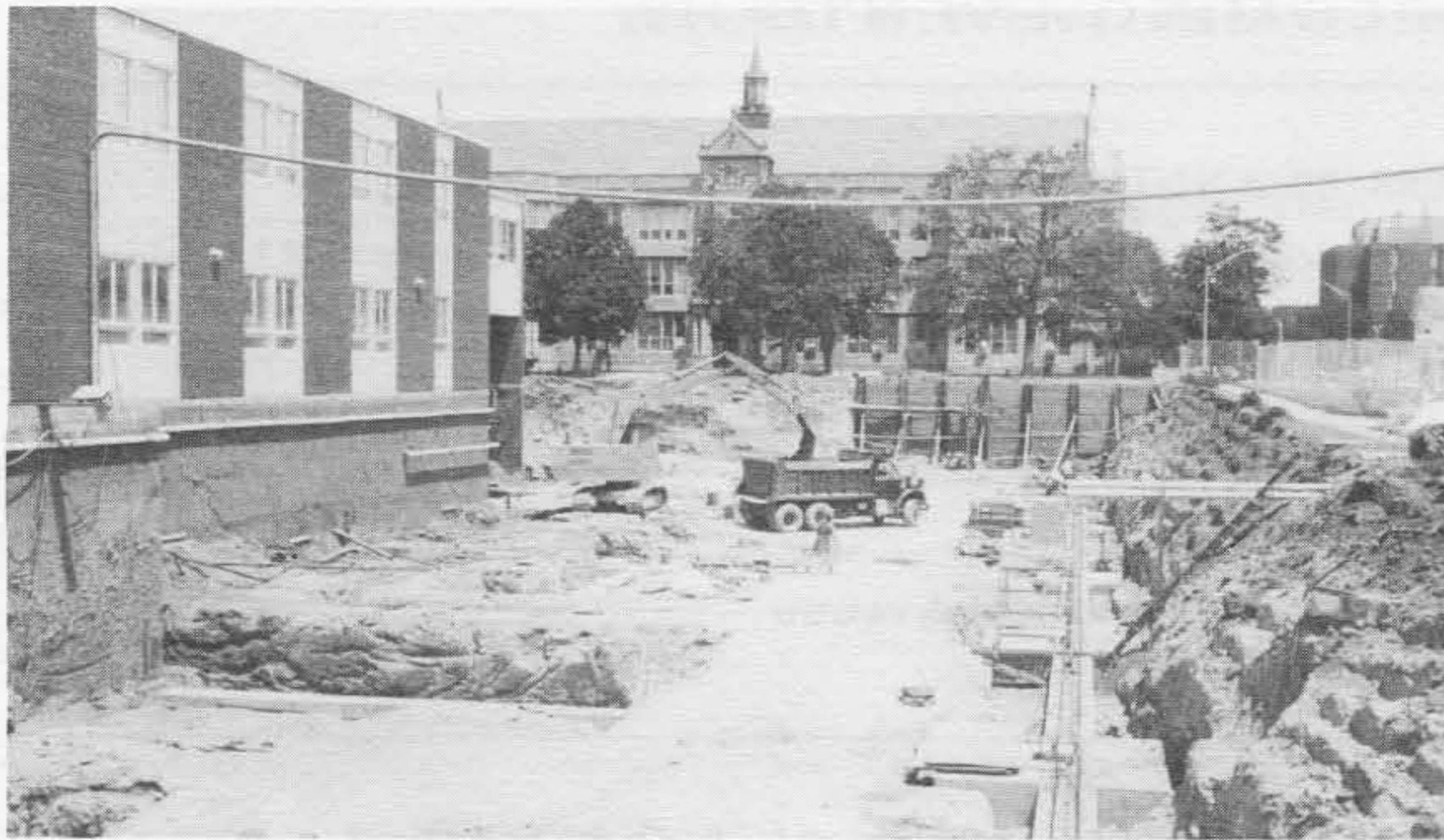
July 1, 1988. Excavation is underway.