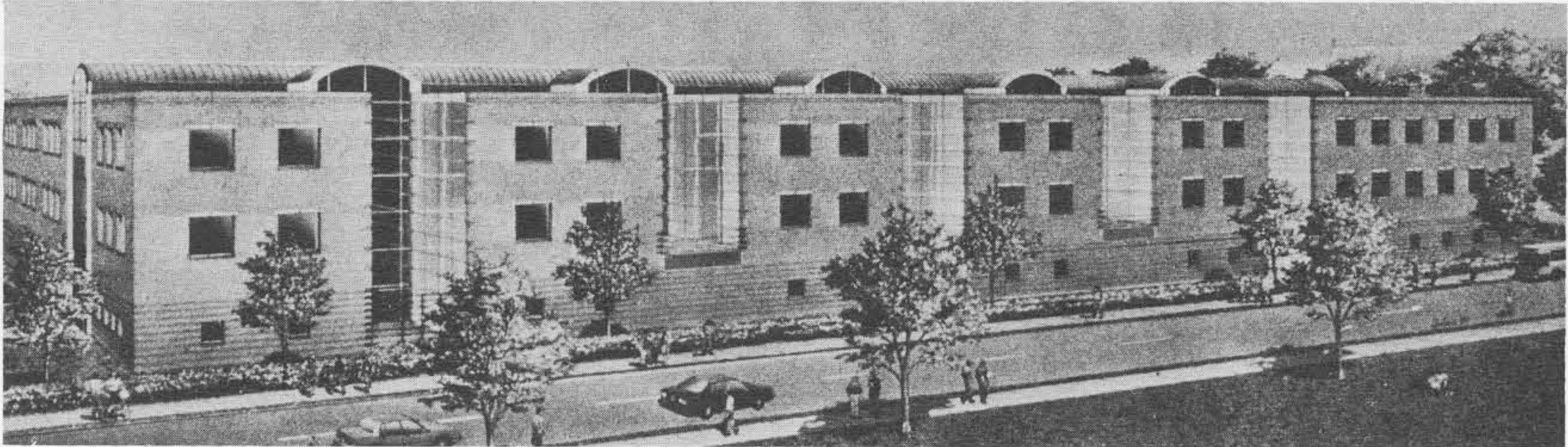
University of Illinois at Urbana-Champaign Computer Science Alumni Association Constituent Group