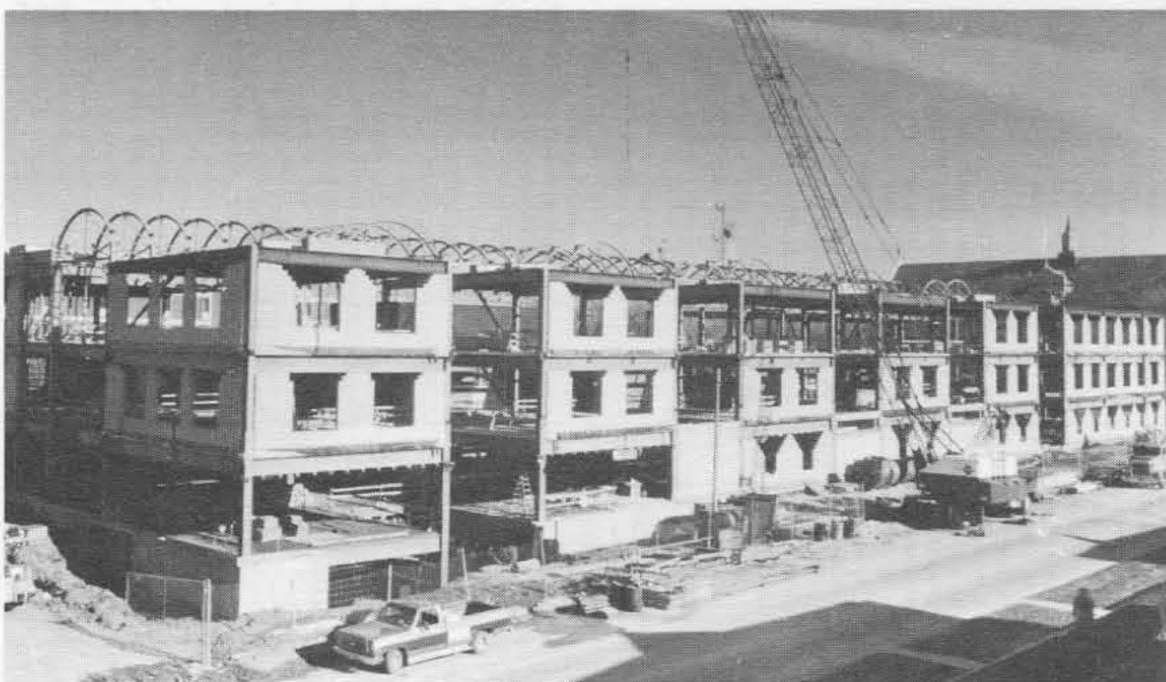
December 6, 1988. The exterior begins to take shape. The trusses for the corridor atrium are all in place.