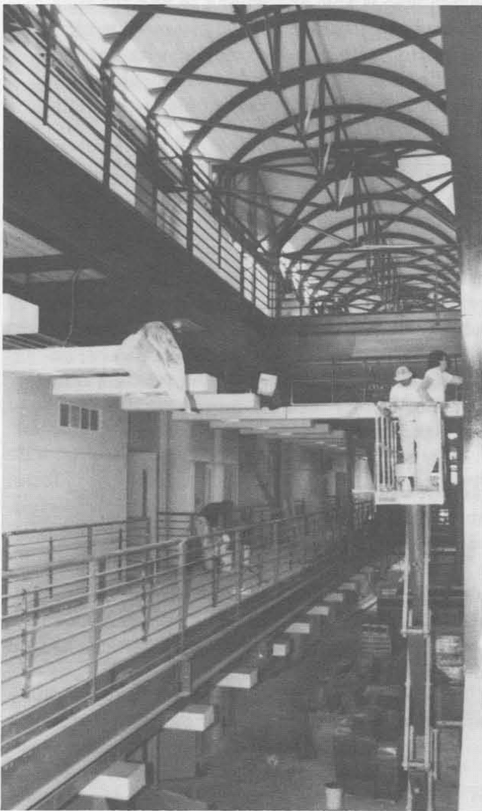
Men work on the south face of the old building, which now overlooks the atrium.