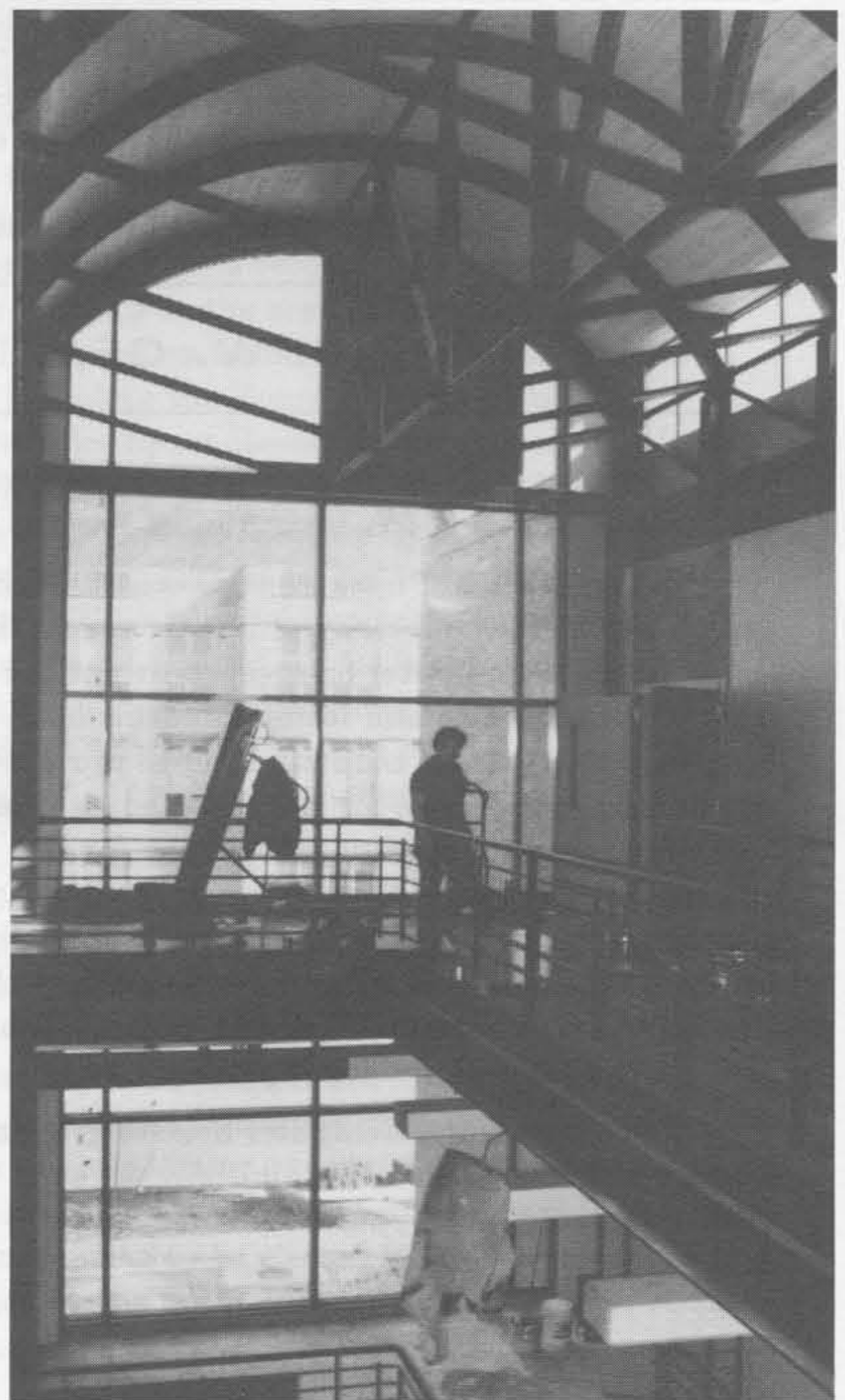
View out the east end of the atrium, with University High in the background.