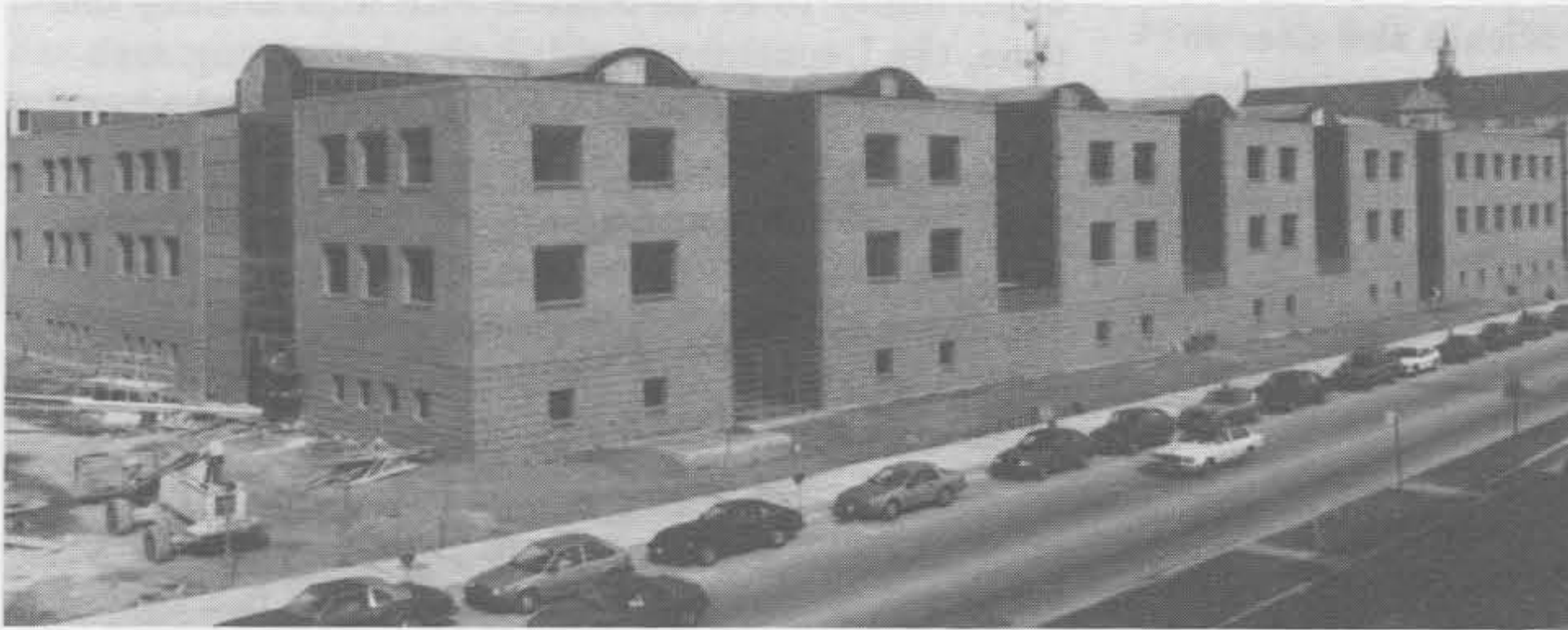
View from the southwest. February 20, 1990.