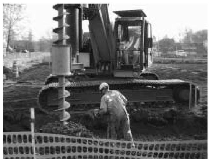
An auger is used to dig pilot holes and loosen the soil before beginning piledriving.