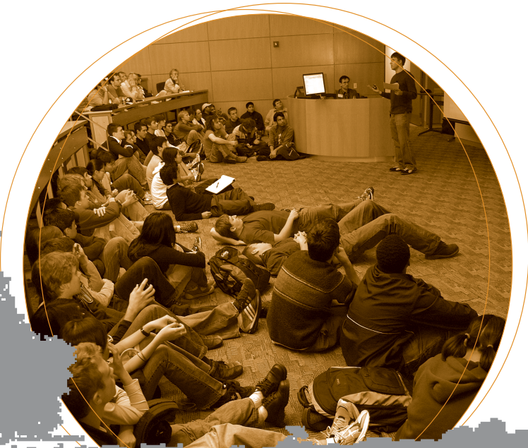
Jawed Karim Speaks to students at ACM conference

called YouTube. The third YouTube founder, Chad Hurley, although not a UIUC alumnus, also was hired by Levchin to work at PayPal and in turn met Chen and Karim.