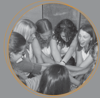
2006 Technical Ambassadors Competition

WCS aims to promote and retain women in CS and has developed many ways to create a supportive environment. In addition to holding various workshops on technical subjects such as artificial intelligence, graphics and computer languages, WCS organizes a Welcome Picnic for new first-year students,