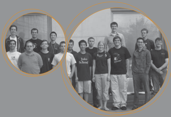
ACM Conference Staff