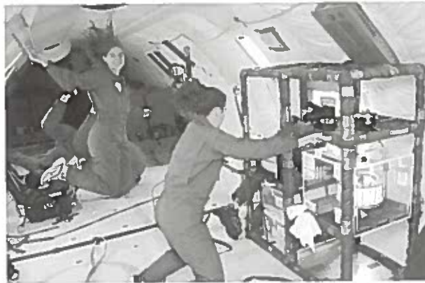
Members of the Float'n Illini discovered that zero-G was like floating in water, without the resistance.

teach us how to float, how to prepare for a fall, how to maneuver in a low-gravity situation, when to prepare for the pullout of the dive, what to do if you get sick—basically so you don't get hurt," stated Lynch. One test included the altitude chamber test, where students are placed in a chamber to simulate an altitude of 25,000 feet. They were asked to take off their masks and breathe the air for five