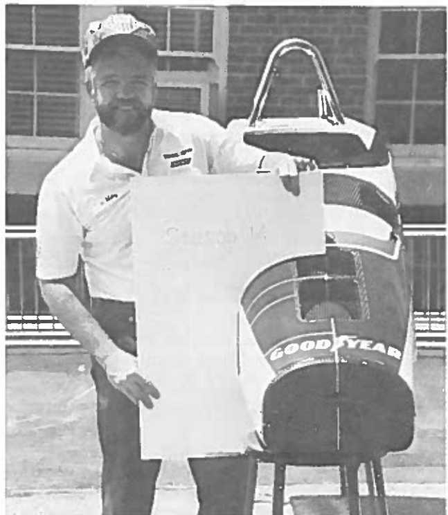
The chassis pictured is that of Roberto Guerrero, who was the third place finisher (in this chassis) at the 1985 Indianapolis 500 Mile Race.

In their initial work, Burns and Metz plan to calculate stresses associated with certain common kinds of racing accidents, such as a contact with a wall which forces the front suspension into the side of the chassis. The first version of their work will necessarily be simplified by assuming that the finite element computer model of the chassis consists of an isentropic, homogeneous material. Later versions may attempt to incorporate the actual construction of the chassis itself, which consists of an aluminum hexagonal honeycomb, covered by 18 layers of carbon fibers on the outside and kevlar on the inside. Such an orthotropic material poses severe difficulties when using the finite element method.