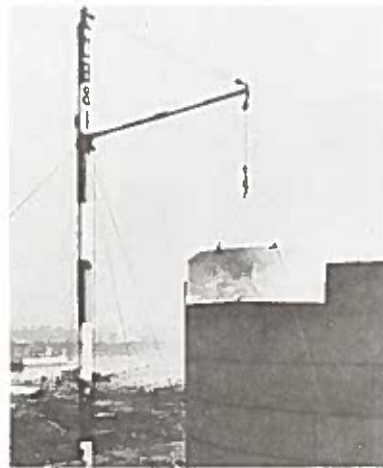
50-TON GUYLESS DERRICK