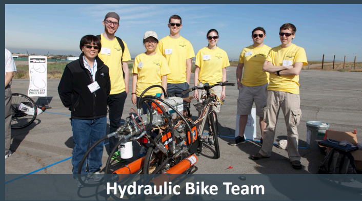
Hydraulic Bike Team