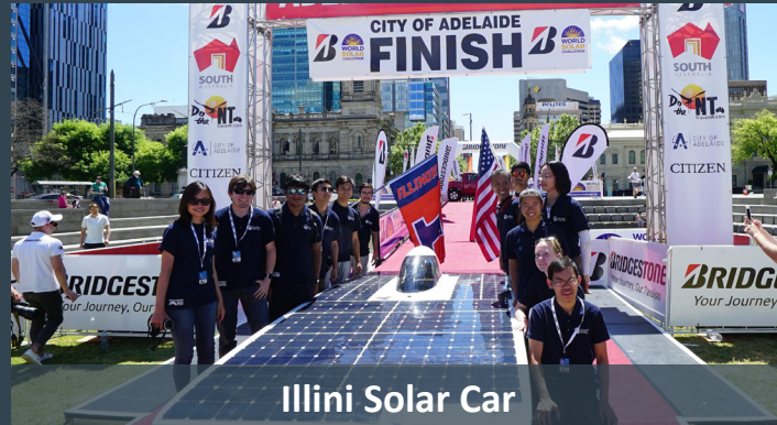
Illini Solar Car