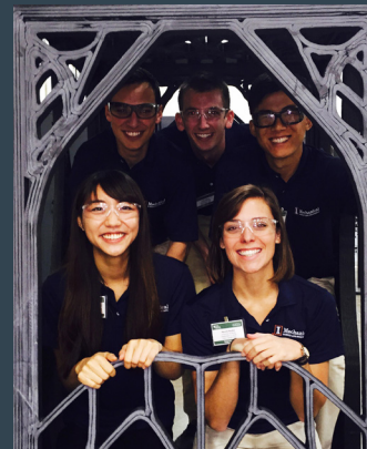
Award-winning 3D printed excavator cab designed by MechSE senior capstone design team.

Engineering Mechanics (EM) builds a solid foundation in math, physics, science, and computer simulation, enabling our students to tackle a diverse set of engineering challenges. Our EM program empowers students to make an impact in an area of their choice with a secondary field. Our small student-to-faculty ratio enhances learning and facilitates undergraduate research experiences. Half of our EM students pursue graduate school and the rest pursue industry positions upon graduation.