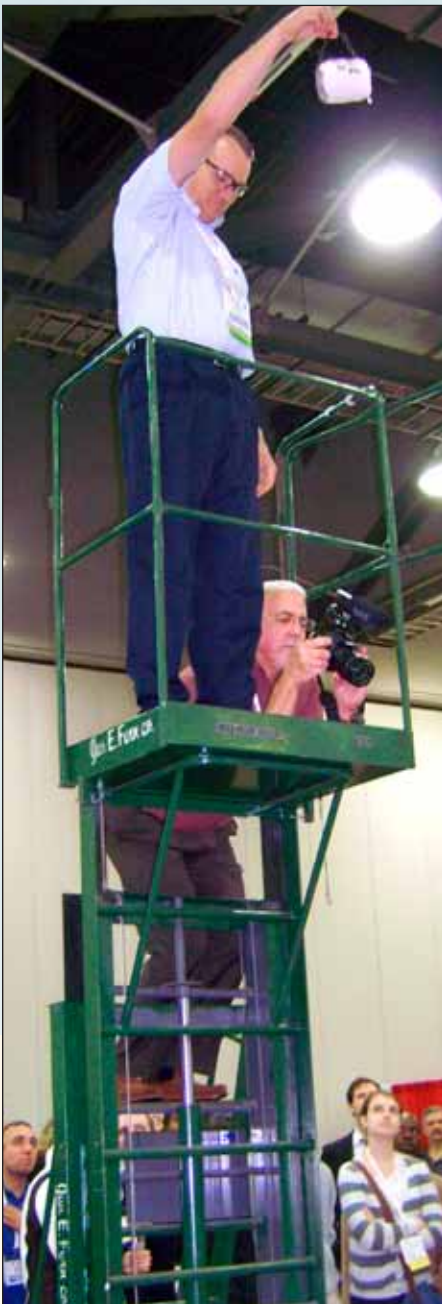
The mugs were dropped from various heights during the competition.

The University of Illinois mugs wouldn't win a beauty contest, but the mugs, made of geopolymer, performed well at the annual ACerS mug drop competition at the MS&T conference. According to Professor Trudy Kriven, geopolymer is a ceramic material because the definition of a ceramic is "a refractory inorganic material." Geopolymer is an oxide, aluminum silicate. The only difference between other aluminum silicate ceramics and glass is the firing process. "This time they made us fire it so we fired it at 300 C, and the performance was a little less," said Kriven. "The first time we made a geopolymer mug, in 2005, we dropped it from the 5th floor of the Baltimore Marriott hotel and it kept bouncing." Unfortunately, this year's geopolymer mugs were disqualified, because the University of Illinois students made the mug's handle of fiber instead of encasing the handle in ceramic material.