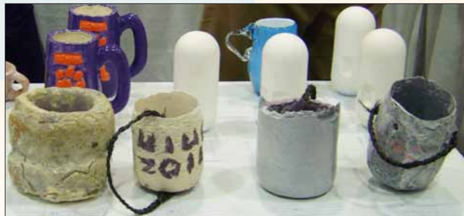
The geopolymer mugs from the University of Illinois are the three mugs from the right on the front row.