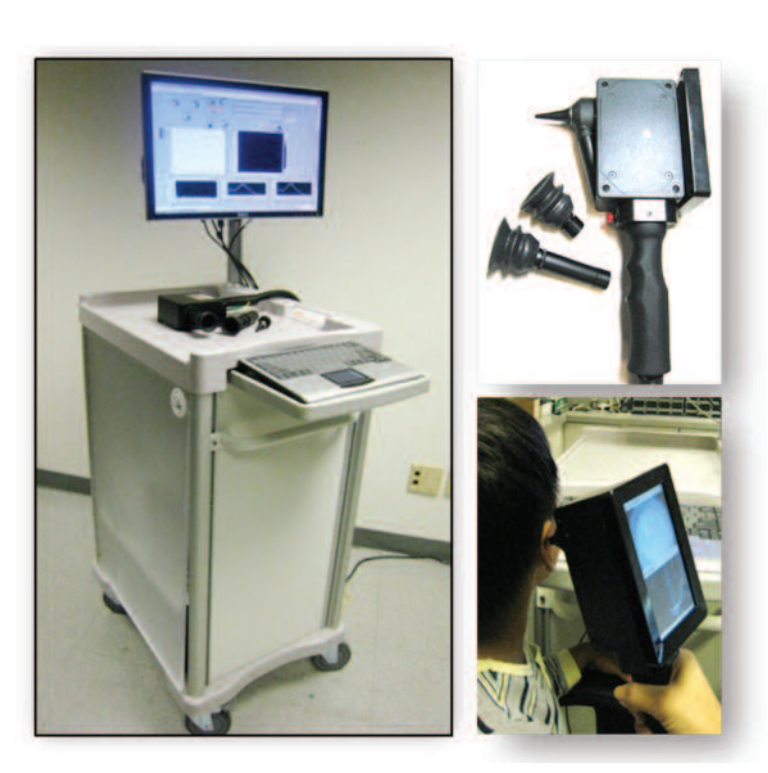
Figure 1: Primary care imaging system is contained in a portable cart along with a handheld scanner. The scanner has interchangeable tips for imaging the ear, eye, oral mucosa, and skin. The handheld scanner also has a video imaging system and display panel to show both the surface video image and the cross-sectional OCT image of the tissue, as shown while imaging the ear.

We are discovering that biofilms are playing an increasingly important role in infectious disease. These thick, adherent, gluelike films formed by polymicrobial communities of bacteria act as protective microenvironments where bacteria can reside and colonise. Antibiotic treatments poorly eradicate the bacteria present within these films, leading to increased antibiotic resistance while providing a reservoir for re-seeding the recurrent infections seen in chronic Otitis Media. In 1996, a seminal paper established a clear link between the presence of middle ear biofilms and chronic Otitis Media in children [5]. This invasive study sampled middle ear mucosa from patients with chronic Otitis Media undergoing tympanostomy tube placement, as well as from control patients undergoing procedures to place cochlear implants. Based on this study, it was evident that the presence of a middle-ear biofilm in chronic Otitis Media could significantly impact the expected outcome of standard antibiotic treatments. It was also realised that if new non-invasive technology was available to detect the presence of a biofilm, characterise its features and dynamics, and monitor