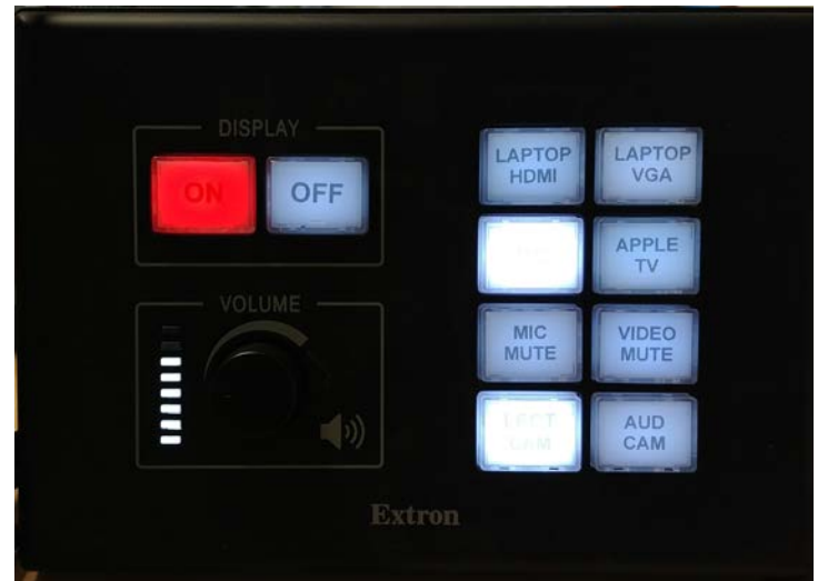
Figure 1 - Control Panel